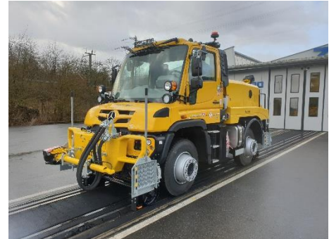
ZAGRO road-rail vehicle

ZAGRO's road-rail vehicles are classified as secondary vehicles. To be allowed to shunt on public and non-public tracks, a permit is required. To obtain this, the vehicles must meet certain technical requirements, which must be proven in an elaborate testing and acceptance procedure. The vehicles are then approved for shunting services in accordance with Section 32 of the EBO and are considered rail vehicles. The use of these vehicles is thus possible on the public rail network.