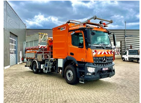
ZWEIWEG overhead line vehicle

The ZWEIWEG HUBMEISTER working platform provides the customer with the ideal platform superstructure for municipal vehicles, equipment carriers, trucks, vans, panel vans, platform chassis, pickups and special applications. Based on the basic platform kits, the HUBMEISTER access platform is assembled according to the user's requirement profile. Additional equipment such as toolboxes, power, compressed air and hydraulics in the workman basket are integrated into the overall vehicle concept on a turnkey basis.