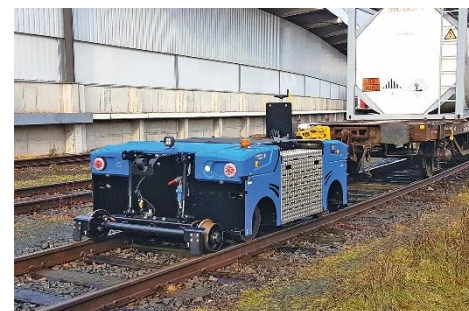
ZAGRO E-MAXI M

Due to the unique selling points of ZAGRO vehicles, namely all-wheel steering, double coupling head and modular design, the customer benefits from great flexibility.