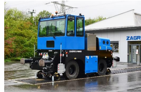
ZAGRO E-MAXI XXL

The ZAGRO E-MAXI XXL is available with battery, hybrid or diesel/electric drive systems. With a maximum total weight of 30 tons, the vehicle has a maximum towing capacity of 2800 tons. As a battery-powered shunter, the vehicle is equipped with lead-acid or lithium-ion batteries. The shunting speed is 6 km/h, and 15 km/h when driving solo. A unique selling point of the unit is its all-wheel steering. Modular design allows for track gauges from 1435 to 1676 mm, different coupling systems, driver's cab, wagon braking system and much more.